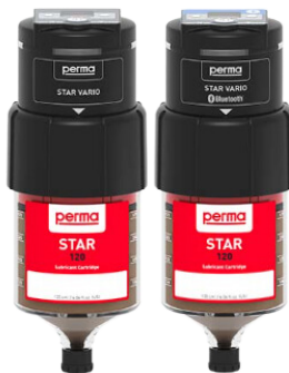
Star Vario/Star Vario Blue Tooth